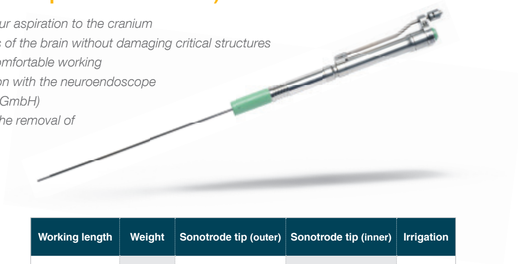
92-030 Micro-handpiece (model Gaab), long, straight