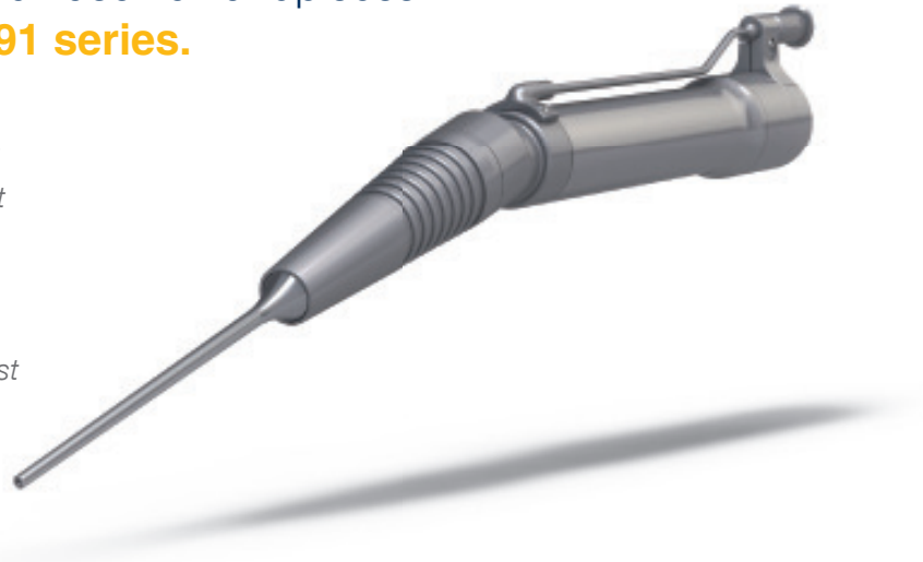
91-020 Micro-handpiece, short, angled