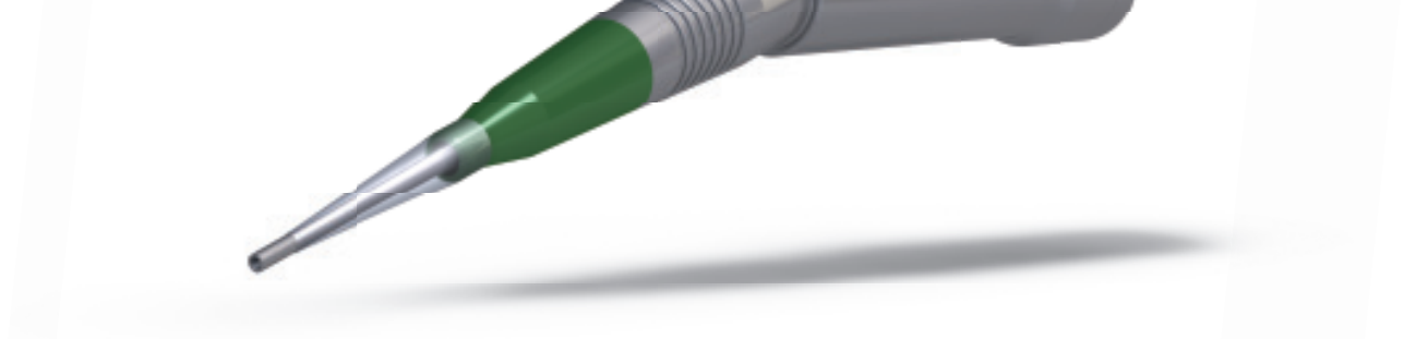
92-020 Micro-handpiece, short, angled